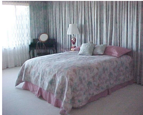
The Beethoven Suite - Decorated in soft pastel tones designed to calm the spirit of the musician, this suite has a full bath attached with shower and Jacuzzi.