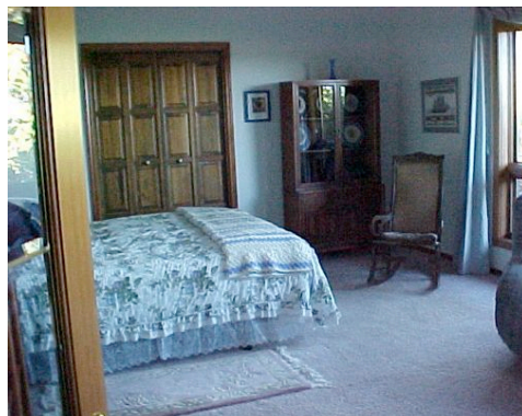
The Blue Room - This cheerful room is large, sunny and blue. There is space for yoga here. It shares a lovely shower bath with The Silk Room, halfway between the two rooms.

The LaFond Conservatory & Retreat and Madame Sandra Zegzula