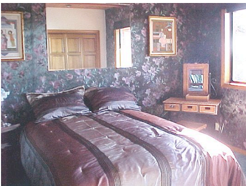
The Silk Room - This room is wallpapered in silk and has beautiful contrasting bedding, just the right balance of yin-yang. The Silk Room shares a lovely shower bath with The Blue Room, halfway between the two rooms.