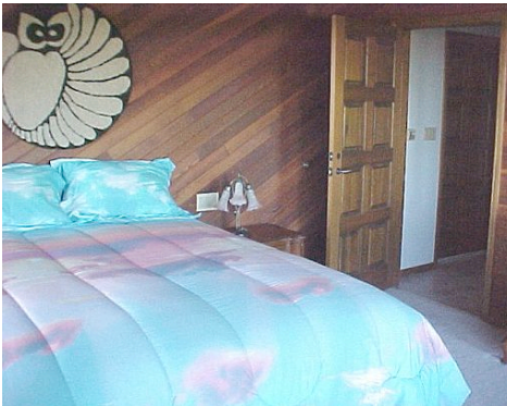
The Mozart Suite - This suite has its own bathroom with large shower. The bedding is subdued and tasteful, enhancing and cheering the soul of the musician.