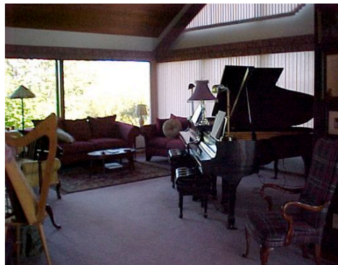
Living Room & Studio - Our beautiful Living Room and Studio boasts two side-by-side grand pianos, a Steinway L and a French mahogany custom. This room overlooks all of western Washington.