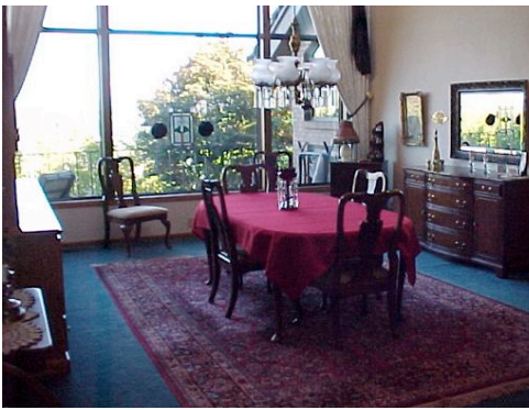
The Dining Room - We can seat twenty people at two antique dining tables. The atmosphere is warm and inviting, designed to enhance enjoyment of some of the best cooking in the world.